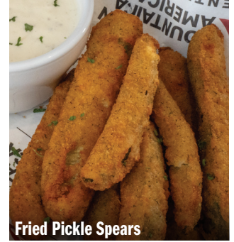
Fried Pickle Spears

JALAPEÑO ARTICHOKE DIP 35/58 Housemade Tortilla Chips