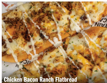
Chicken Bacon Ranch Flatbread