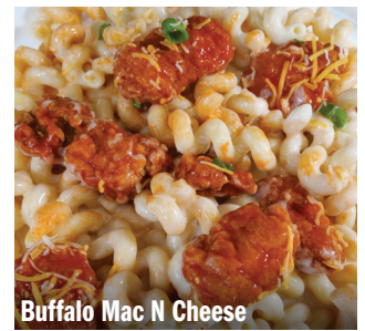
Buffalo Mac N Cheese